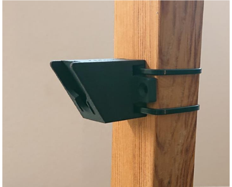
Straps can be used to fasten the mount.