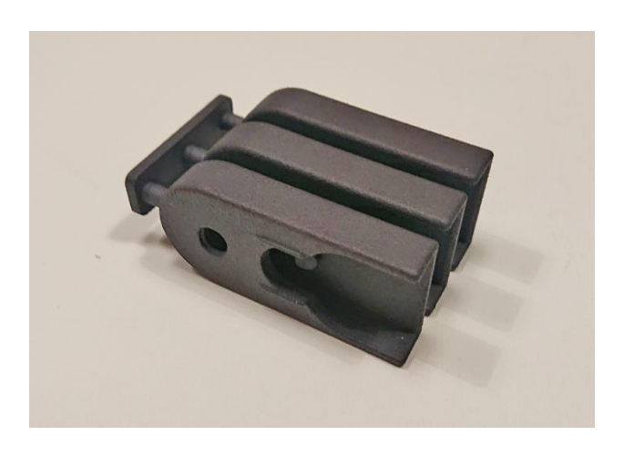
The adapter comes in sets of three.